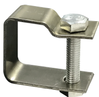
C - Clip