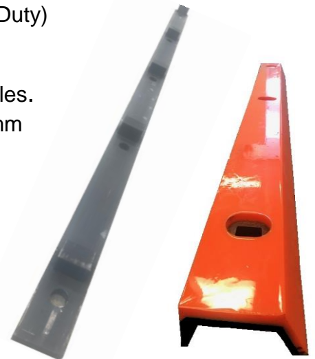
Poly-Coated Clamp Bar & Hold Down Bar

Christchurch P 0800 880 233 F 0800 880 234 sales@advanced-eng.co.nz