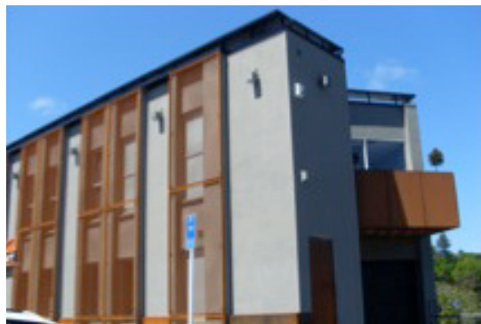
* Weldrite (NZ) – 32.4 apt x 6.0 wire BHD