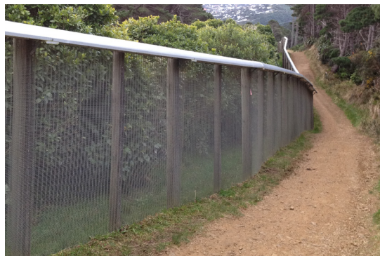
* Karori Wildlife Sanctuary Project, 8.6km of Predator Woven Wire Mesh